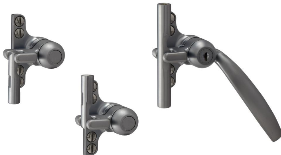
B646NOSE & 2 Connectors

Steel Window Fittings / Window Handles / B158/Triplex